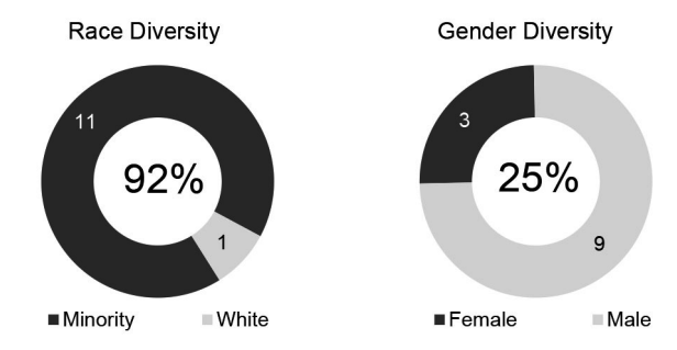
Our 12-member Board of Directors consist of 11 members of minority descent and a quarter of the Board seats are held by women.

Inclusion and diversity are the cultural hallmarks of the Company. We believe that a diverse mix of directors with complementary qualifications, expertise, and attributes brings diverse perspectives that reflects on strong Board practices contributing to the overall oversight responsibility.